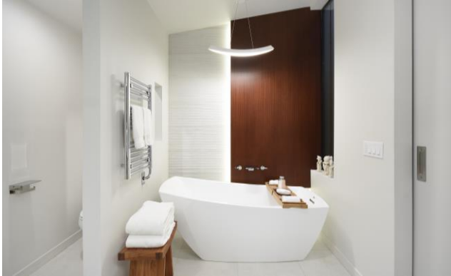
2020 1st Place Large Bathroom Design by Candace Nordquist, CKD